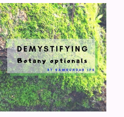
11th agri group subjects. 11th agri book tamil. What are the subjects in 11th agriculture. Class 11th agriculture syllabus. 11th agri book pdf. 11 agriculture syllabus.